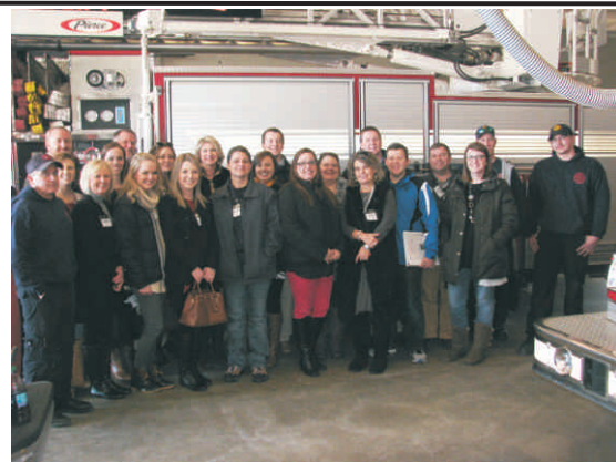
Quality of Life