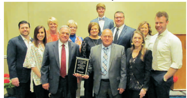
The Huffstetler Family

They believe God has blessed them with great employees and wonderful customers over the past 40 years. They say that "God's plan is always the best plan...both back then and in today's world."