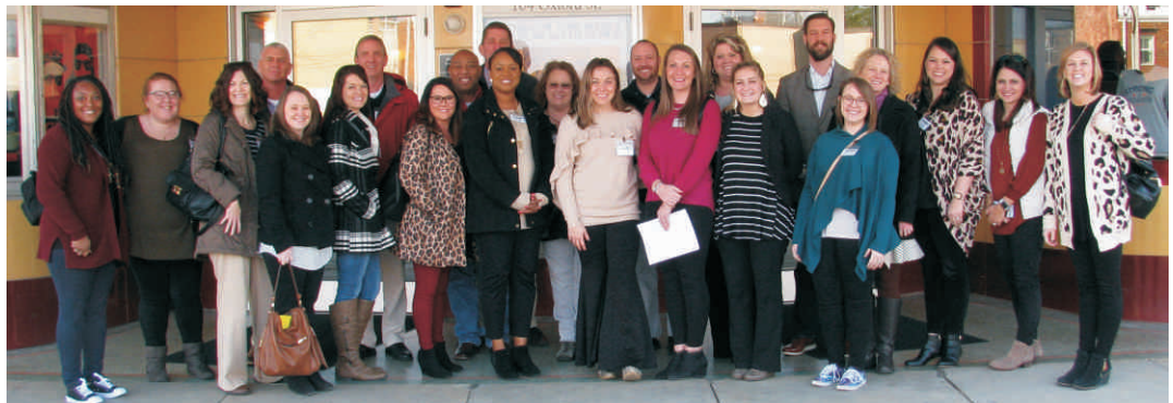
Quality of Life